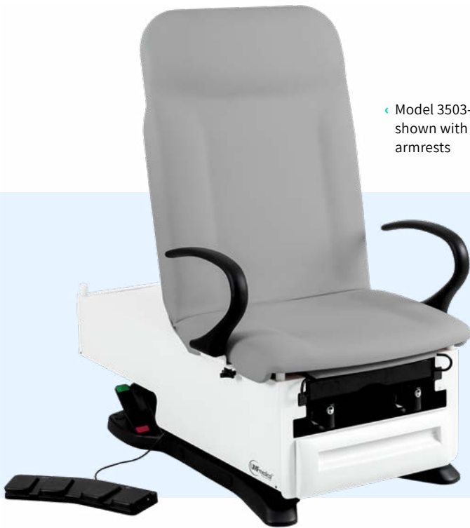
Model 3503-500-305 shown with optional armrests

The OneTouch WheelBase® System from UMF Medical makes moving our ProGlide™ Series of products as easy as pushing a pedal. The integrated central-locking wheelbase with an intuitive foot pedal enables staff to move the equipment easily and quickly for cleaning, then lock it solidly into place for exams.