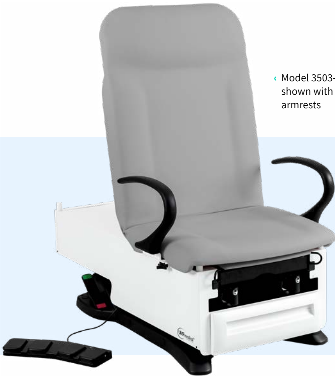
Model 3503-500-305 shown with optional armrests

The OneTouch WheelBase® System from UMF Medical makes moving our ProGlide™ Series of products as easy as pushing a pedal. The integrated central-locking wheelbase with an intuitive foot pedal enables staff to move the equipment easily and quickly for cleaning, then lock it solidly into place for exams.