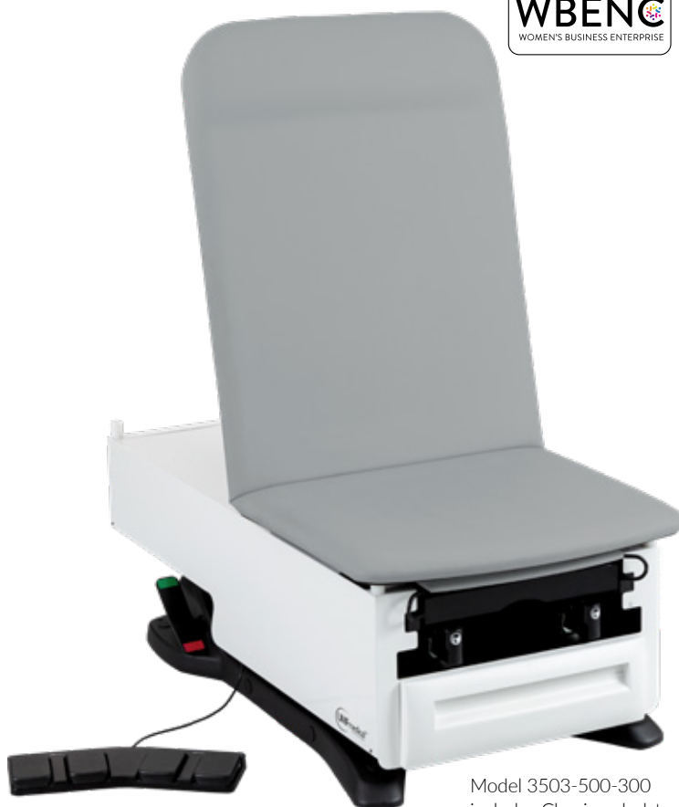
Model 3503-500-300 includes Classic upholstery