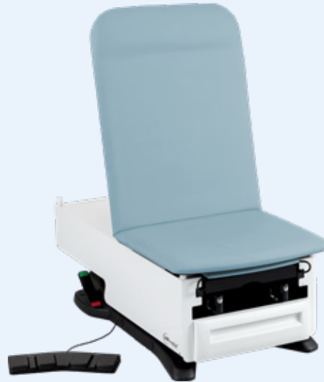
Classic Upholstery Model 3503-500-300