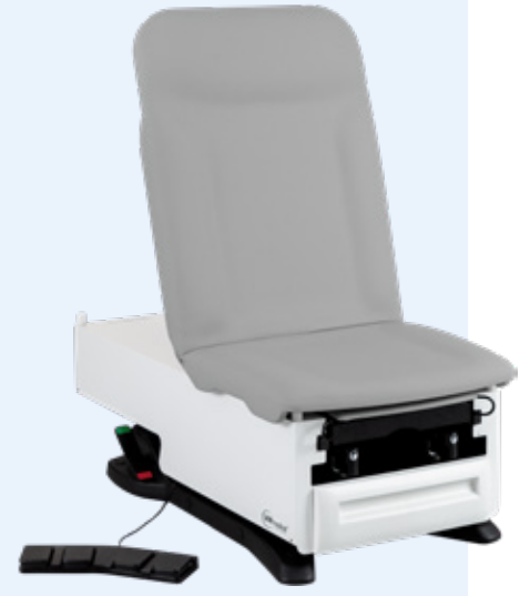
Premium Upholstery Model 3503-500-305