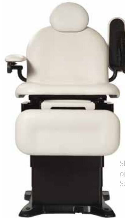
Shown with options (047 Self-Leveling Arms)